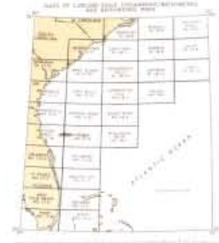
SOUTHEASTERN UNITED STATES REGIONAL MAP